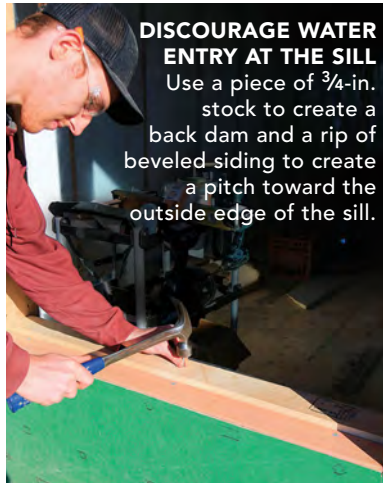
DISCOURAGE WATER ENTRY AT THE SILL Use a piece of ¾-in. stock to create a back dam and a rip of beveled siding to create a pitch toward the outside edge of the sill.