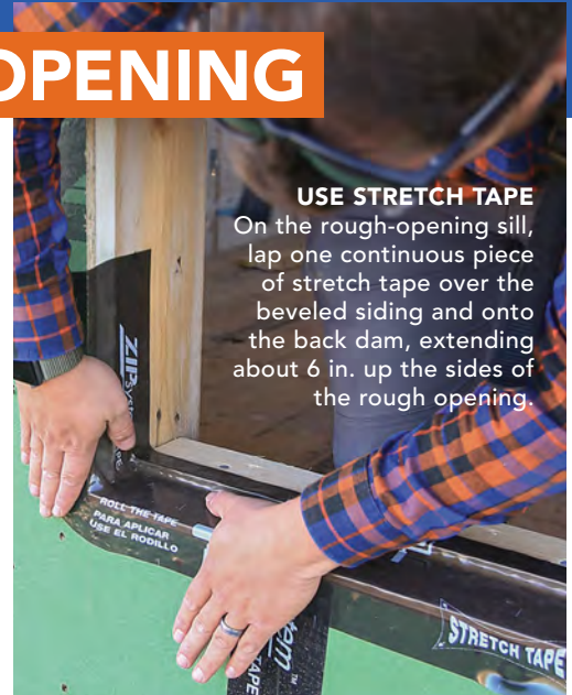
USE STRETCH TAPE On the rough-opening sill, lap one continuous piece of stretch tape over the beveled siding and onto the back dam, extending about 6 in. up the sides of the rough opening.