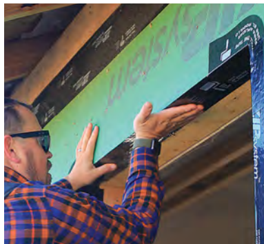
WORK YOUR WAY UP For the sides and top of the opening, I use two parallel, overlapped rows of 4-in. seam tape, which is more readily available in my area than wider rolls. The sequence is sides, then upper corners (which are less vulnerable to water and can be sealed with short pieces of flexible flashing), then across the top. After all the tape is in place, press every square inch using a hard-rubber roller.